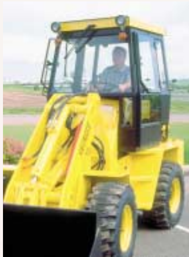
Optional hard cab provides all-weather operator enclosure. ROPS guard is standard.

Swinger quality components include John Deere diesel engine, Dana axles and Eaton hydrostatic power. Swinger 3000 features short run hydrostatic over mechanical drive for easy operation and simple maintenance. Diagram shows hydrostatics (green motor) mounted to the mechanical gear reducer (red). It's simple mechanical drive from the gear reducer to the wheels (yellow).