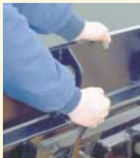
Quick-Attach system lets operator locate and lock attachments.