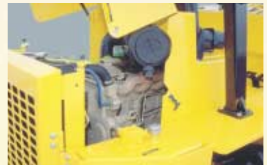
80 hp John Deere Powertech diesel supplies ample power for propulsion and attachments. Hood lifts, rear door opens and seat tilts for full engine access.