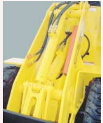
Steel plate lift arms, steel fenders and heavy duty lift cylinder and are standard equipment