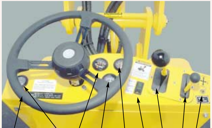
Swinger drives like a car Hour meter Engine temp. Volt meter Oil press. Bucket level Joy stick Aux hyd. On/off