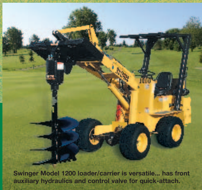
Swinger Model 1200 loader/carrier is versatile... has front auxiliary hydraulics and control valve for quick-attach.