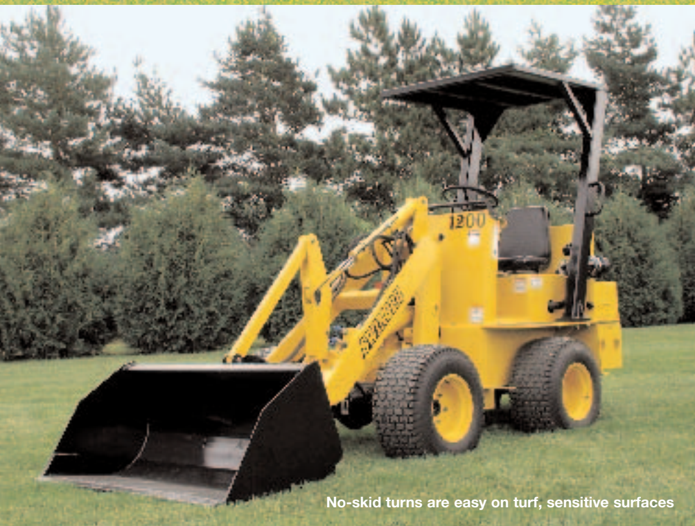
No-skid turns are easy on turf, sensitive surfaces

Swinger 1200 is a landscaper's dream with a compact loader/tool carrier — and a trailer full of job-critical attachments (center photo below). The ride-on power unit features auxiliary hydraulics, 32 hp diesel and no-rut articulated steering