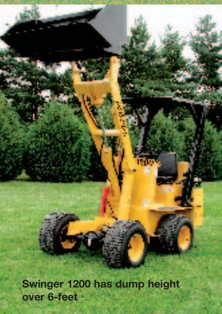
Swinger 1200 has dump height over 6-feet

Swinger Model 1200 is ideal for landscape, tree care and turf contractors who need a complete equipment system.